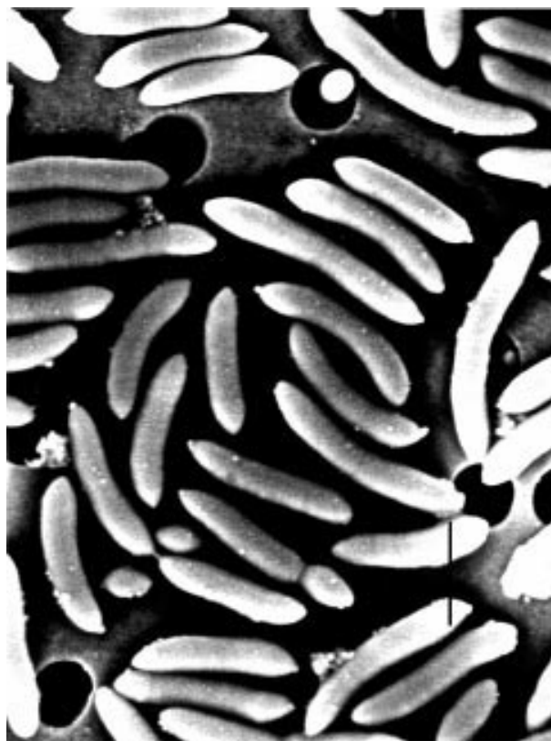
Figure 1 Scanning electron micrograph of Paenibacillus hongkongensis . The bacterium is straight or slightly curved and is aflagellated. Cells vary in length from 1.44 to 2.50 \mu\text{m} and in diameter from 0.28 to 0.39 \mu\text{m} (mean, 1.82 \times 0.31 \mu\text{m} ; n = 20 ). Bar, 1 \mu\text{m} .

Vitek) were used for the identification of the bacterial isolate in our study. The minimum inhibitory concentration (MIC) of penicillin, cefotaxime, and vancomycin on HKU3 was performed using the E-test method.